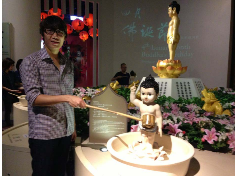
FoGuang ShanMonastery in Kaohsiung city.

I live in the dormitory of International Students outside the campus, which is very nice and comfortable. Having spent 5 months in Taiwan helps me find out that I really love people around here, I really love the environment, I really love NTOU and I really love Taiwan. Finally I just want to say "Thank you and Hope to see you again, Taiwan".