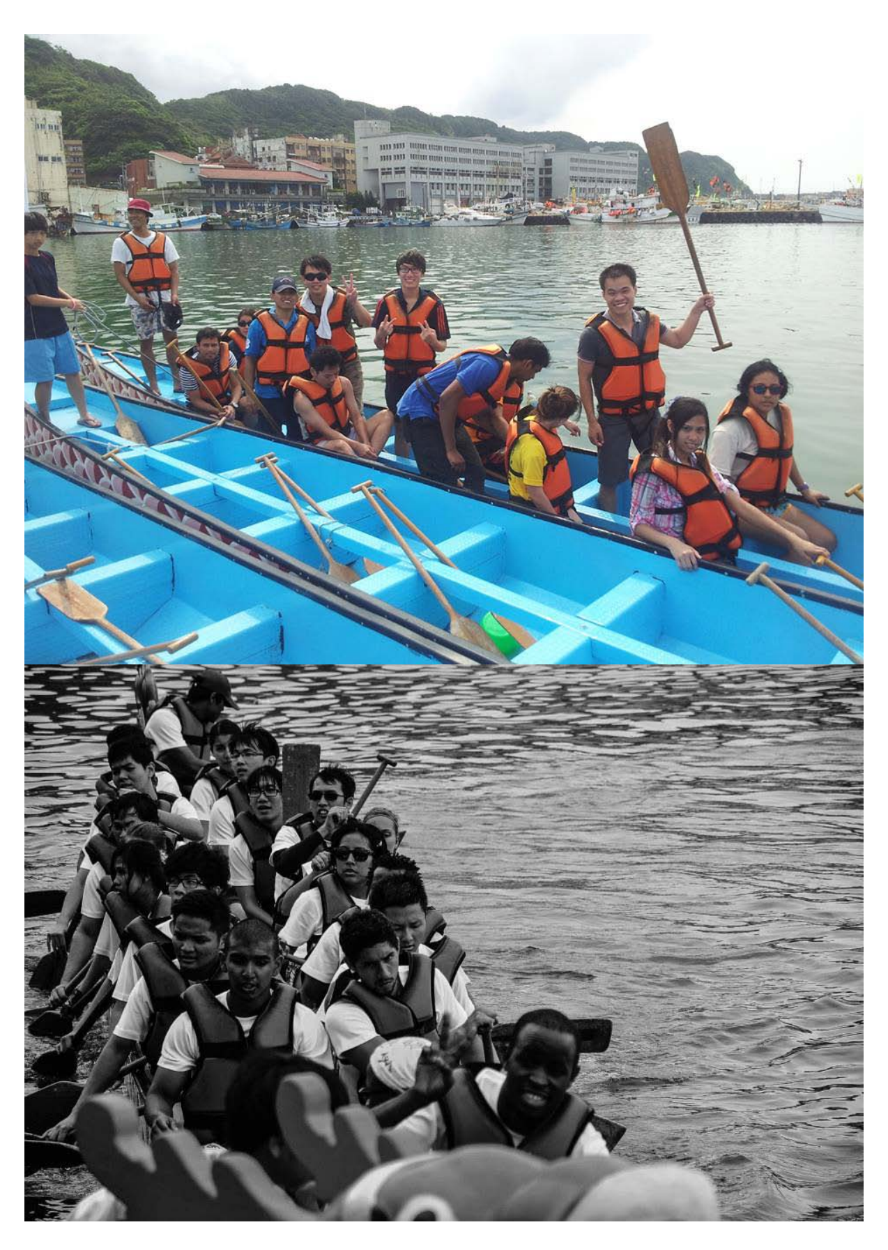
Dragon boat festival

Be side\ took\ part\ in\ outdoor\ activities,\ I\ also\ visited\ some\ beautiful\ places\ in\ Taiwan.